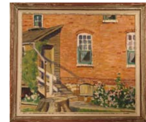
Door in Amana, Grant Wood, 1930

Showcasing the Muscatine Art Center's own collection by Iowa's Artists.